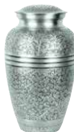
SILVER OAK $185 00