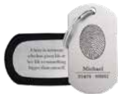
MILITARY DOG TAG FROM $95