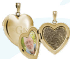
LOCKET FROM $290