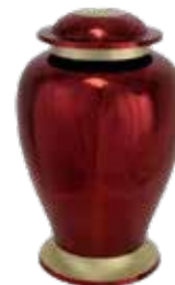
GLEAMING RED $185 00