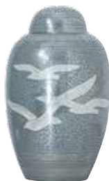
GOING HOME BLUE $185 00