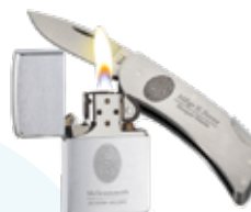
FOR HIM FROM $185