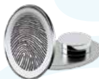
LAPEL PIN FROM $210