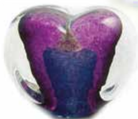
HEART $345 00