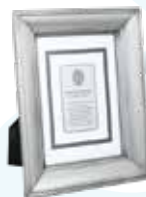
FRAMED MEMORIAL FROM $130