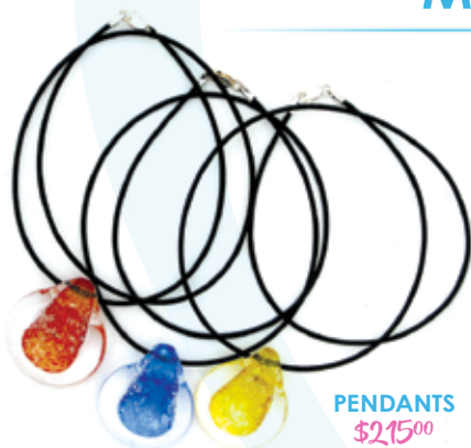
PENDANTS $215 00