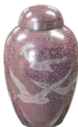
GOING HOME PINK $185 00